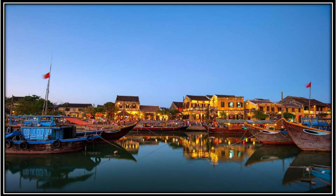
Overnight in Hoi An